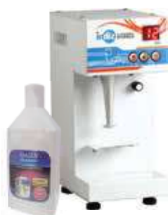
Daily Cleaning Solution